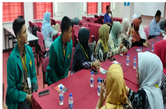
Picture 4. Socialization of Activities and Academic Tasks of the KKN USK Students

Furthermore, students socialize about their assignments and the required reporting during the KKN activities. Some of the reports socialized included activity proposals, the KKN Logbook, and the final report on the implementation of the KKN. These reports explain various activities that include elements of the tri dharma of higher education, namely education and teaching, research and development, and community service.