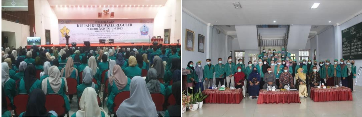
Picture 1. KKN Universitas Syiah Kuala

Guidelines of the Ministry of Education, Culture, Research and Technology (Kemendikbud Ristek), Syiah Kuala University carries out various KKN activities related to the tri dharma of higher education, which consists of education/teaching, research, and community service.