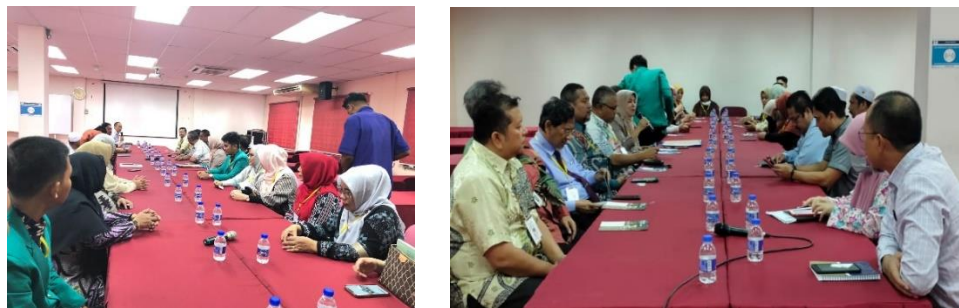
Picture 3. Dissemination of the KKN USK Program

The EKP lecturer conveyed information related to the implementation of KKN activities. Information disseminated related to KKN registration guidelines, filling out forms that KKN participants must complete, the coordination process with KKN target areas, determining field supervisors, and some information related to other technical activities, such as student debriefing.