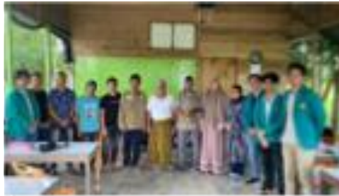
Figure 1. Focus group discussion with local people and team

From discussions with the groups, several priority issues were determined to be resolved through this community service program, namely: 1) Insufficient technical guidance for guides due to high training costs. 2) The rafting business management is still very traditional due to a lack of business management knowledge. 3) Business income is very low. In certain months, no income due to a lack of marketing and financial strategies; 4) Marketing strategy is very minimal, and the brand is almost unknown to the public.