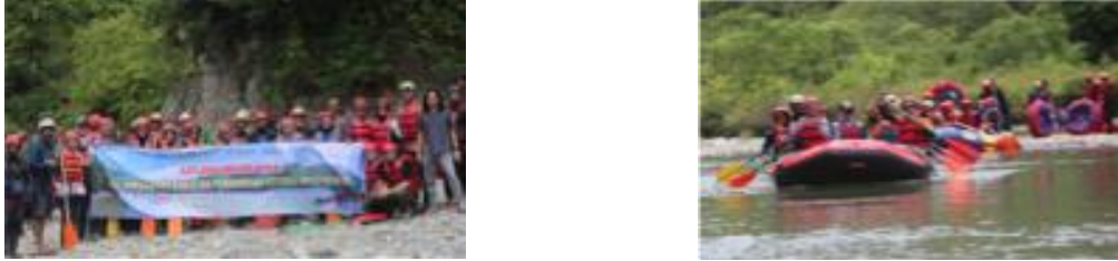
Figure 6. Jalin Jantho Water Rafting Brand Awareness Activities

boats and 5 river tubs. Before the groups started rafting, the head of the committee provided safety procedures. The rafting took around 3 hours. After that, the participants had lunch together at the finish point in Jalin Rafting camp.